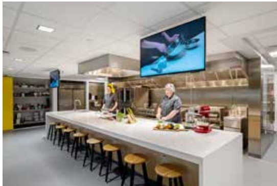
Carroll County Public Library's Exploration Commons at 50 East. Credit: Maximilian Franz, Manns Woodward Architects