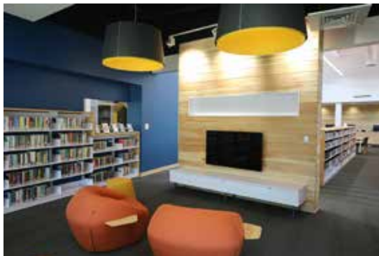
Queen Anne's County Library's Kent Island Branch expansion.