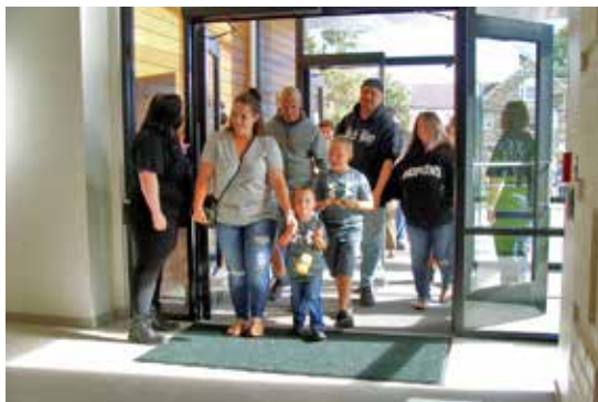
Allegheny County Library System's LaVale Library ribbon cutting day.