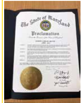
Governor Hogan's Proclamation of Recognition for School Library Month in April 2022.