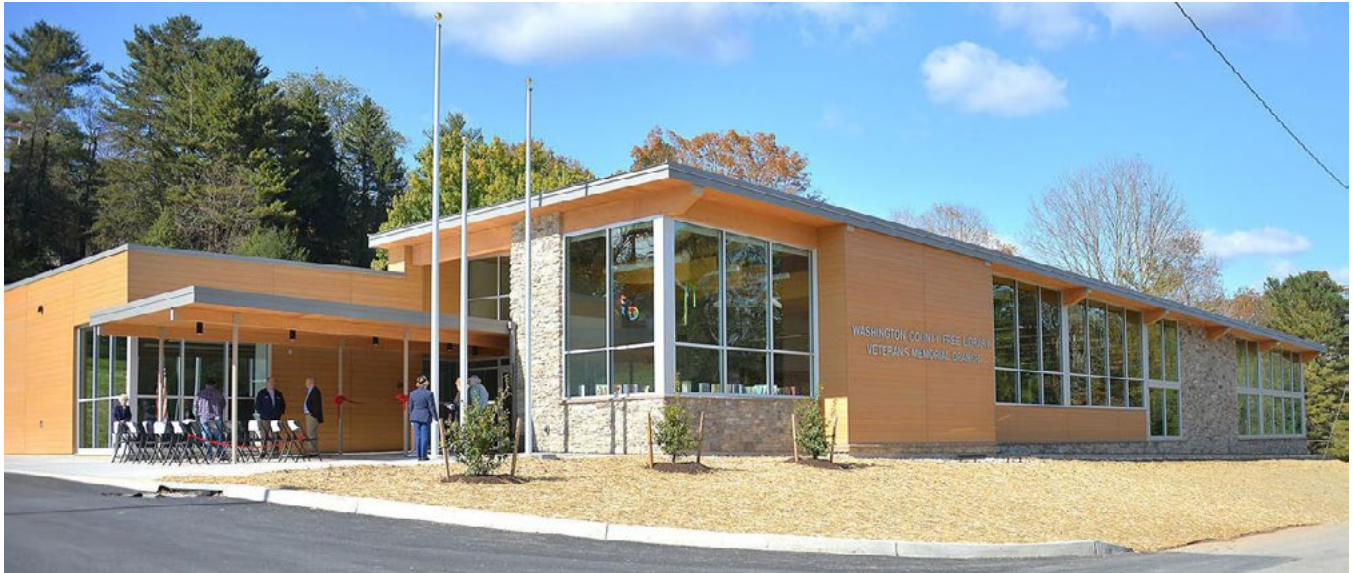
Above: Washington County Free Library opened the new Veterans Memorial Branch in Hancock, MD on October 30.